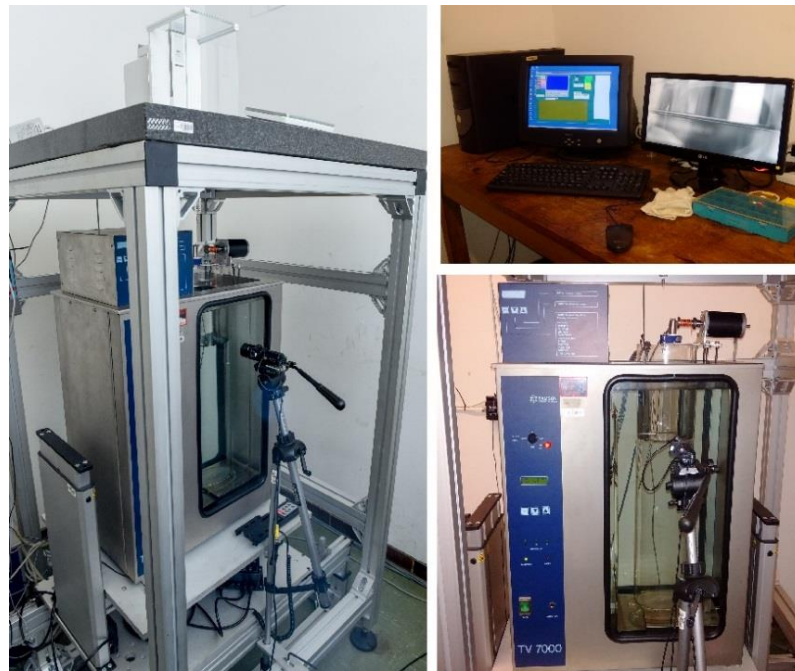
Figure 1: The hydrometer system at NMISA.

that is used to maintain the temperature of distilled water (reference liquid) in the inner vessel at around the reference temperature of 20 °C. The inner liquid vessel contains three temperature sensors positioned at different depths (in case of any temperature gradient inside the reference liquid) to measure the temperature of distilled water at the time of weighing the hydrometer in liquid. A desktop computer has the software that is used for finer adjustments of the scale mark to the liquid level and for the collection of measurement data from the sensors (air temperature, relative humidity, pressure and water temperature) as well as from the balance. The image from the CCD camera is magnified and viewed on a computer monitor.