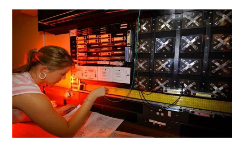
Figure 1: Laboratory cubicle

Each student is required to purchase a Laboratory Manual and a Laboratory Result Book [17] as key instructional resources. The Laboratory Manual contains theories, methods and procedures while the Result Book provides templates for data collection, calculation of unknown parameters, plotting of graphs and submission of the final report. At the beginning of each practical session, students are briefed on the practicals to be performed before being afforded the opportunity to perform the practicals individually. A typical laboratory cubicle and excerpt from the Result Book are shown Figures 1 and 2 below. On completion of the experiment, students are afforded an opportunity to discuss related laws and theories coupled with a comprehensive explanation of the pitfalls and expectations of the excel rubric marking programme (ERMP).