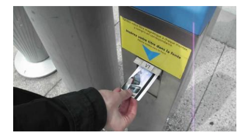
Insert your ticket in the slit beneath the arrow