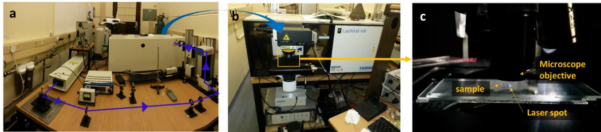
Figure 1: (a) Back view showing the path travelled by the laser into the LabRAM HR, (b) front view of the spectrograph, (c) enlarged view of the sample undergoing fluorescence

Three spots along the irradiated region and three spots along the un-irradiated regions of each sample were tested in order to gauge the ratio of loss to fluorescence yield over the wavelength range of 350-500 nm.